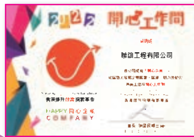
2022 HAPPY COMPANY 2022 開心工作間

As a good corporate citizen, we deliver reliable and professional engineering services, and we are devoted to giving back to the community. AEL has been awarded the "10 Years Plus Caring Company Logo" in recognition of our commitment in Caring for the Community, Caring for the Employees and Caring for the Environment. We actively encourage our employees to participate in voluntary services and support the needy. Over the years, AEL volunteer team has taken part in various community activities, such as charity run, costal cleanup, winter clothes distribution to vulnerable groups, cooperating with Tung Wah Group of Hospitals on other CSR projects etc..