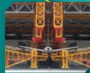
7. Chengdu Tail Docking System