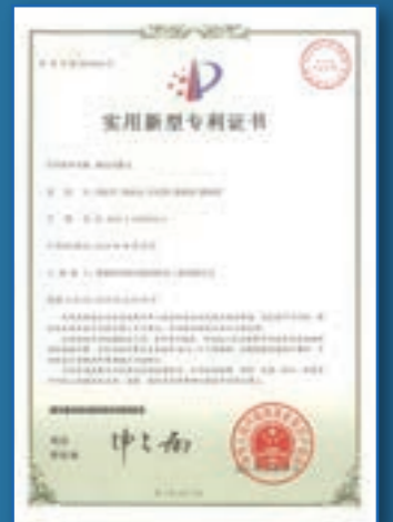
Patent of Rolling compaction head: 2015 滾動式推頭專利證書2015