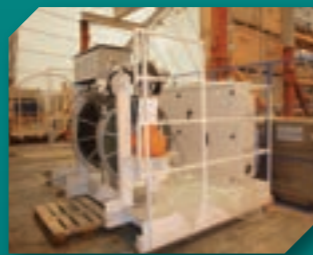
5. Guangzhou Daya Bay Nuclear Power Station AEL liaised with Reel of France to supply a special crane to the first commercial operated nuclear power station in Daya Bay Nuclear Power Station.