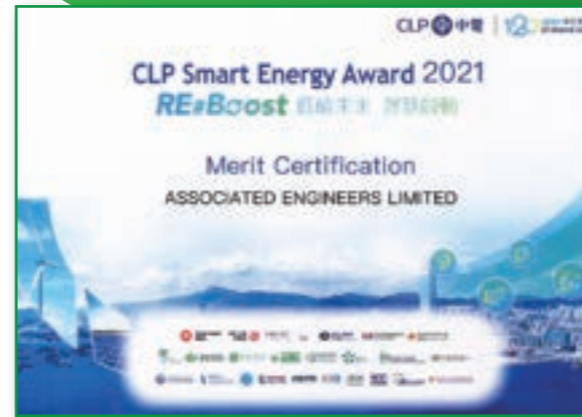
The CLP Smart Energy Award - Merit Certification 「中電創新節能企業大獎」優異證書