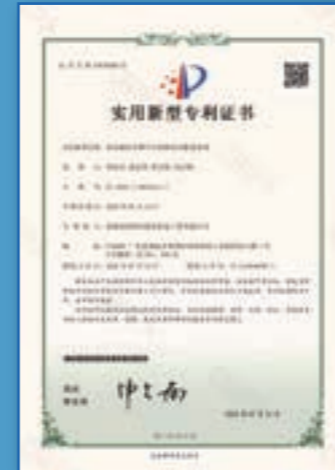
Patent of Movable counterweight system for Telescopic Platform: 2022 面向懸掛升降平台的移動式配重系統專利證書2022