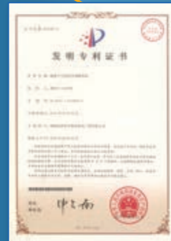
Patent of Synchronous adjusting system for maintenance platform: 2015 維修平台的同步調整系統專利證書2015