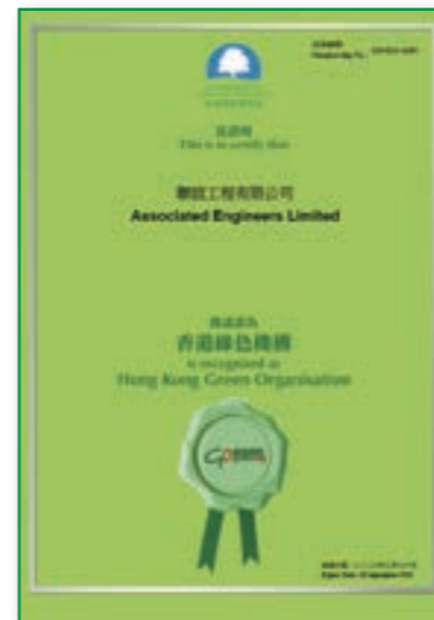
Hong Kong Green Organization 香港綠色機構