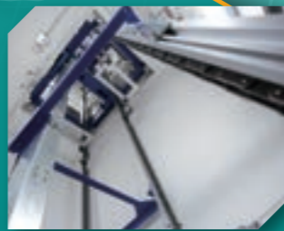
3. Hong Kong Vertical Conveyor System AEL designed, supplied and installed the first vertical conveyor system for hospital.