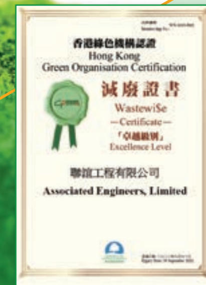
Wastewi$e Certificate - Excellent Level 節廢證書「卓越級別」