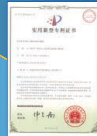
Patent of Inclined refuse transfer station: 2015 傾斜垃圾壓縮機專利證書2015