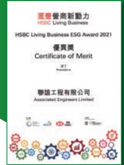
The HSBC Living Business ESG Award 2021 - Certificate of Merit 「滙豐營商新動力」環境、社會及管治獎 - 優異獎