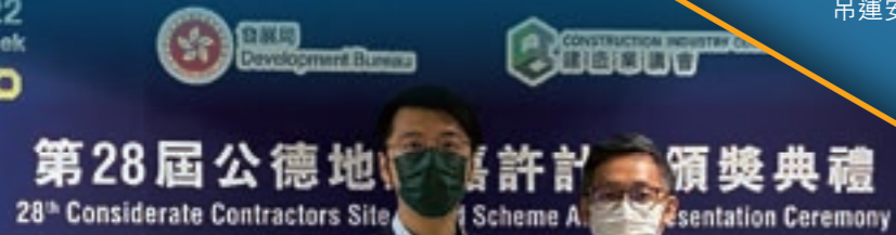
第28屆公德地盤嘉許計劃頒獎典禮 28 th Considerate Contractors Site Award Presentation Ceremony