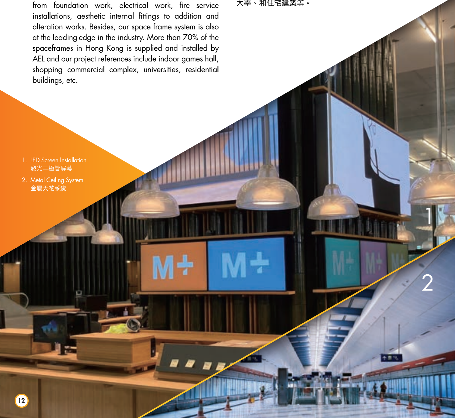
2. Metal Ceiling System 金屬天花系統