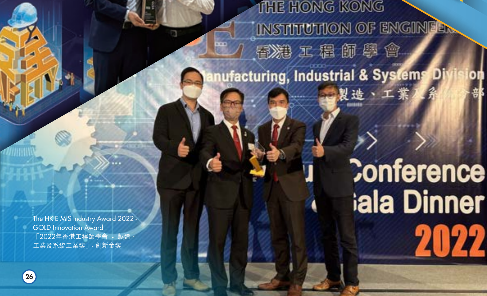
The HKIE MIS Industry Award 2022 - GOLD Innovation Award 「2022年香港工程師學會 - 製造、工業及系統工業獎」- 創新金獎