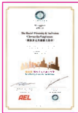
Support The Racial Diversity & Inclusion Charter for Employers 支持《種族多元共融僱主約章》

作為一個良好企業公民，我們提供可靠安全而專業的工程服務，並致力為社會發展作出貢獻。聯誼獲頒「10年+商界展關懷」標誌，以表揚我們對關懷社群、關心員工及愛護環境方面作出貢獻。我們鼓勵員工踴躍參與義工服務與社區活動，幫助有需要社群。過去數年，聯誼義工隊參與了不同的義工活動，包括慈善跑、海岸清潔、社區派發禦寒各物及物資，及協辦東華三院義工項目等。