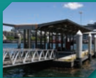
2. Australia King Street Wharf AEL supplies nine pontoons to Sydney King Street Wharf and it becomes one of the top Sydney attraction in the Waterfront.