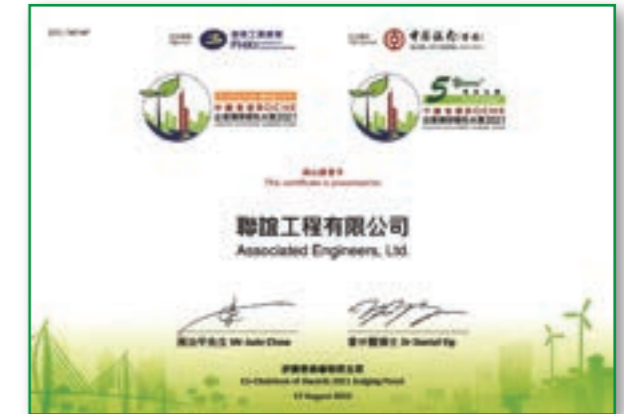
BOCHK Corporate Environmental Leadership Awards: 2021 中銀香港企業環保領先大獎2021