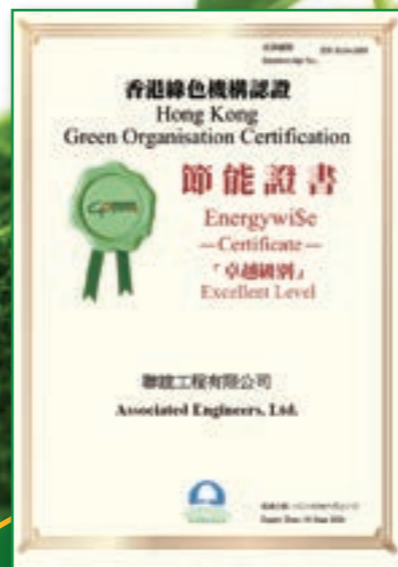
Energywi$e Certificate - Excellent Level 節能證書「卓越級別」