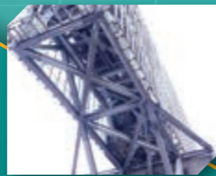
3. Hong Kong Structural Steelwork AEL has long track record in the design and construction of structural steelwork.