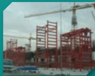
1. Dubai Mega Terminal The biggest cargo terminal in the Middle East and one of the top terminals in the world which fully automated air-cargo handling facilities.