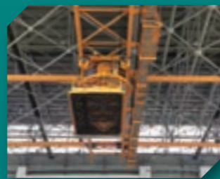
6. Urumqi Maintenance platform installed at aircraft hanger in China.