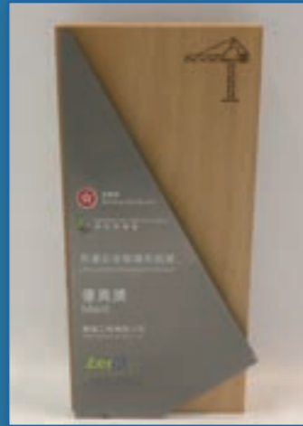
Lifting Safety Management System - Merit Award 吊運安全管理系統獎 - 優異獎