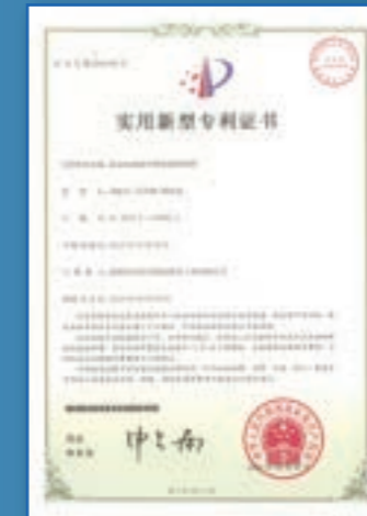
Patent on Food-waste vacuum collection system: 2016 廚餘垃圾真空收集處理系統專利證書2016