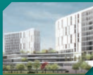
4. Macau Automatic refuse and linen collection system at Macau Health Services Complex.