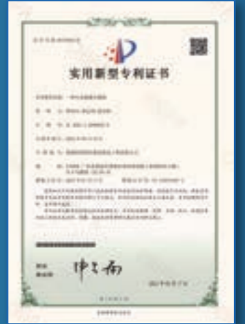
Patent of Linen Separator for ARCS: 2023 一種污衣被服分離機專利證書2023

聯誼工程具有強大的創新企業文化，多年來不斷投資於研發。在過去的二十多年中，我們獲得了飛機維修設施和廢物處理領域的許多專利。我們堅信在穩固的基礎上尋求逐步發展，並在創造力上建立我們的未來。