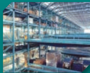
3. Hong Kong Hactl Super Terminal 1 The largest single air-cargo terminal in the world handling 3.5 million tons of cargo per year.