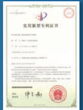
Patent of Food-waste moisture separator: 2016 廚餘垃圾蒸氣分離器專利證書2016