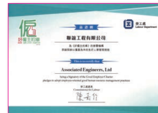
Signatory of the Good Employer Charter 《好僱主約章》的簽署機構