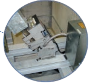
Unintended car movement protection device 制停系統的防止機廂不正常移動裝置