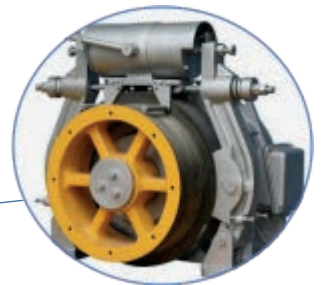
Double brake system 雙重制動系統