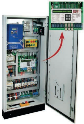
Obstruction switch to protect suspension ropes 保護懸吊纜索的障礙開關掣