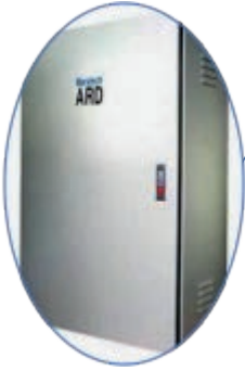
Automatic rescue device 自動拯救裝置