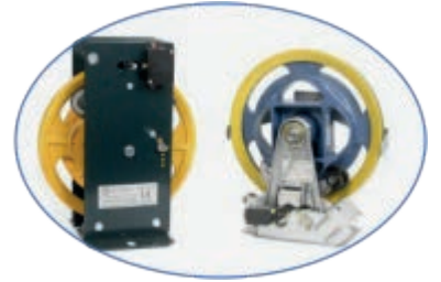
Ascending car overspeed protection device 防止機廂向上超速裝置