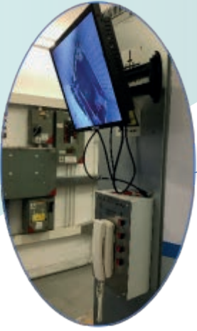
CCTV & intercom system 機房閉路電視與對講機系統