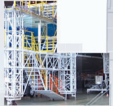
Multi-level Nose Docking System