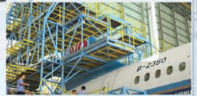
Wing dock System