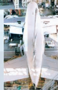
Tail Dock Enclosure