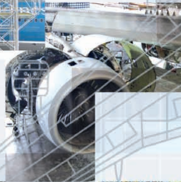
Fuselage Dock System