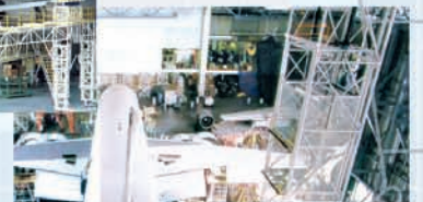
Multi-aircraft Docking System